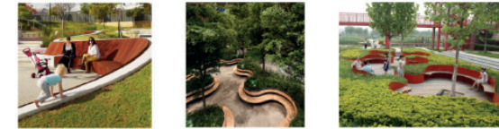
spaces with diverse dimension and multiple use possibilities

These principles were the basis for guiding simple and replicable solutions that ensured the application of this principles in different spaces, even in informal areas. This process included the active participation of mothers who brought their desires to the public space through the social networks of Estúdio+1. The questions were posted on our instagram and the answers helped drive the design process.