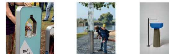
access to water